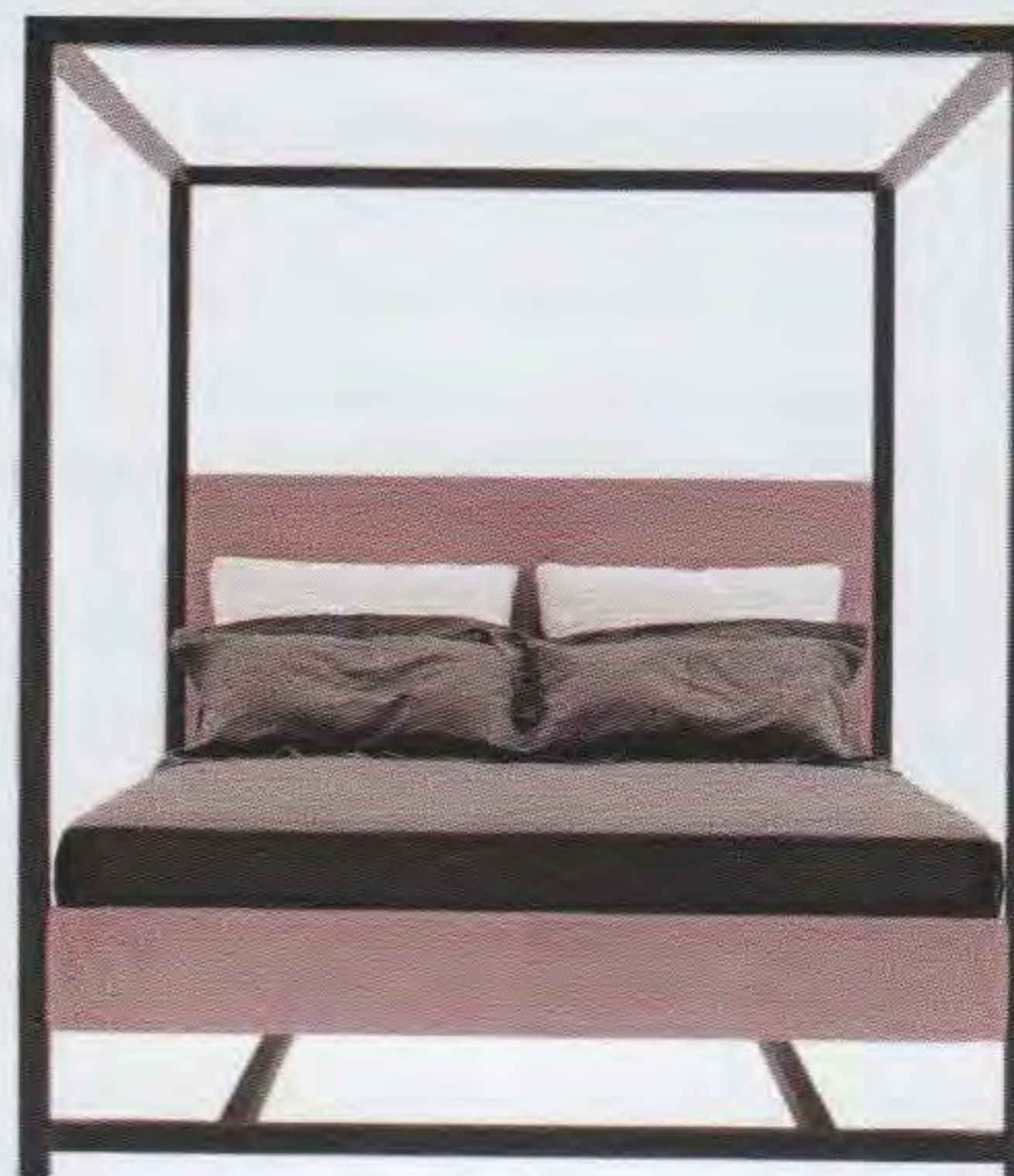
silk wall hanging, or bed cover, at Richard Morant; 'Florence' foot stool by Nuttall Home; 'Alcova' bed by B&B Italia